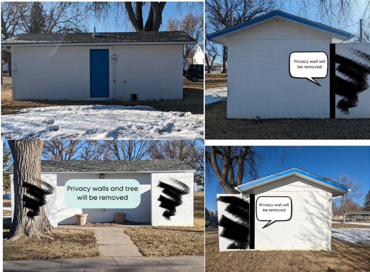
Barton Park public restrooms. Specs to remove privacy walls for handicapped accessibility.

There will be construction on the building this Spring/Summer to remove the current privacy walls so they are ADA handicapped accessible. The public restroom building exterior is 25 feet wide on the North and South walls, 10 feet wide (with the removal of the privacy walls) on the East and West walls and 9 feet (peaks) and 8 feet tall- approximately 630 square feet. The artist may choose to apply a mural to a portion of the building or to its entirety with consideration to existing features and fixtures, such as doorways and utilities. More photos available here .